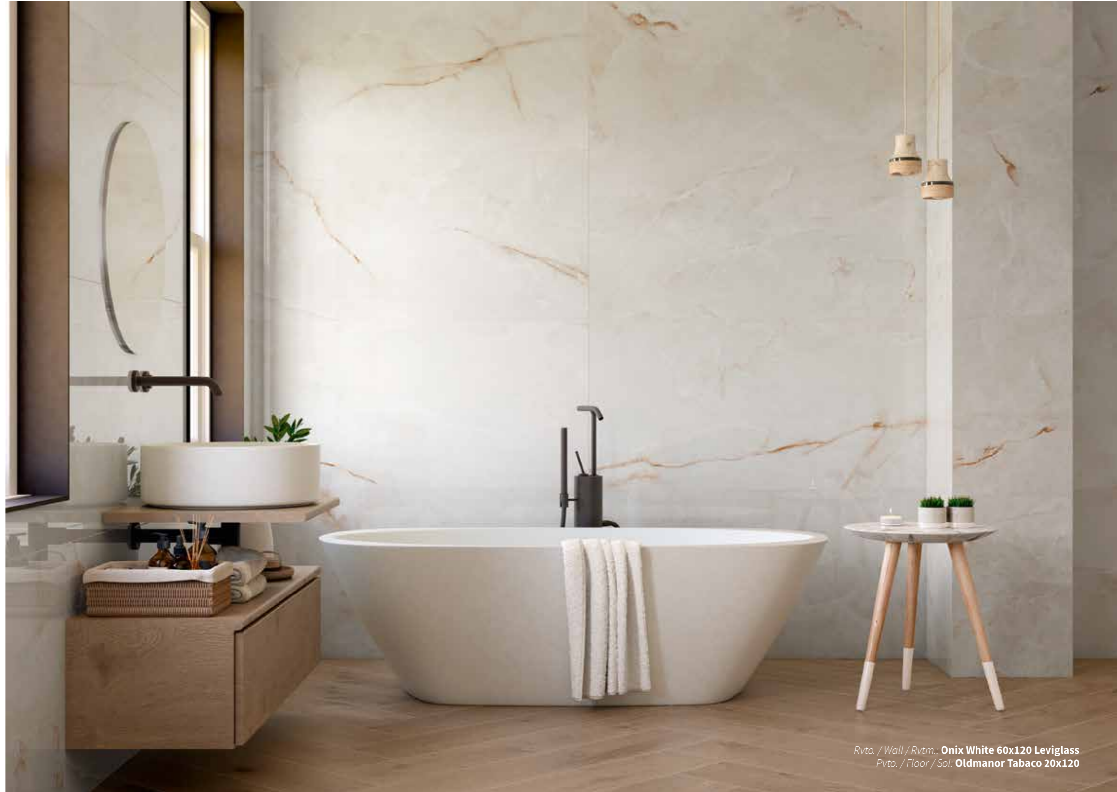
Rvto. / Wall / Rvrm.: Onix White 60x120 Leviglass Pvto. / Floor / Sol: Oldmanor Tabaco 20x120